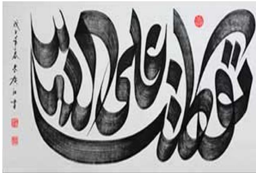
Figure 1 Haji Noor Deen, My Trust in Allah , ink on paper, 230 x 102 cm, 2008. (hajinoordeen.com).

has mastered traditional Islamic calligraphy and he creates a unique calligraphy painting, that presents the beauty of this art. Noor Deen has been teaching traditional calligraphy and Islamic art to a modern audience. (Haji,2015:p3) An example of Noor calligraphic art work is presenting on Figure 1