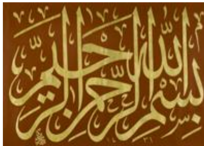
Figure 2 Mohammed Zakariya, In the Name of God, Universally Merciful, Specifically Merciful , Green gold lead, Tara cloth, natural red Italian earth with acrylic, 42x 28 inch, 2010. (zakariya.net).

One of the most remarkable and well-known calligraphers from the United States who is influenced by tradition Islamic calligraphy is Mohamed Zakariya. Zakariya combines traditional standards with a modern sensibility to produce calligraphy painting that is presented on paper. He uses traditional tools and styles to write Islamic calligraphy and he has introduced a classic calligraphy style of painting that emphasizes the Arabic language and the religion of Islam. Zakariya is known as the ambassador of the art of Islamic calligraphy in America. (Zakariya,2015:p3). An example of Zakariya calligraphy art work can be seen on Figure 2.