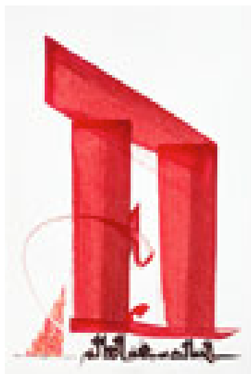
Figure 4 Hassan Massoudy, Beauty Will Save the World , Water-based pigments on paper, 75x 55 cm, 2008. ( http://hassan.massoudy.pagespersorange.fr ).

Ahmed Mustafa, a contemporary calligrapher, uses the Quranic text in most of his paintings. Mustafa is an Egyptian calligrapher. Mustafa, inspired by the sacred Qur'anic verse, states that "Western art deals with the casual, rather than what I call the immutable essence. As Michelangelo said, 'Good painting is nothing but a copy of the Perfection of God.'" Moustafa's calligraphy painting combines the classic with the contemporary as well as Western painting with an Islamic tradition. Also, through his work, Moustafa's paintings represent a sacred and spiritual space that comes from the holy Quran. His painting incorporates language, in an abstract contemporary style, by changing traditional calligraphy to an artistic language.